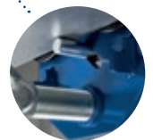
Falling down protection