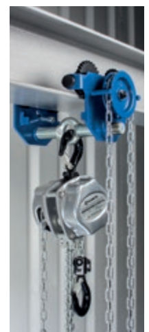
Option: GTS with manual chain hoist PREMIUM PRO