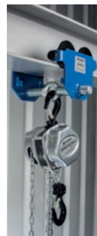
Option: PTS with manual chain hoist PREMIUM PRO

Important: The manual trolleys shown are designed for use with manual hoists. use with manual lifting equipment.