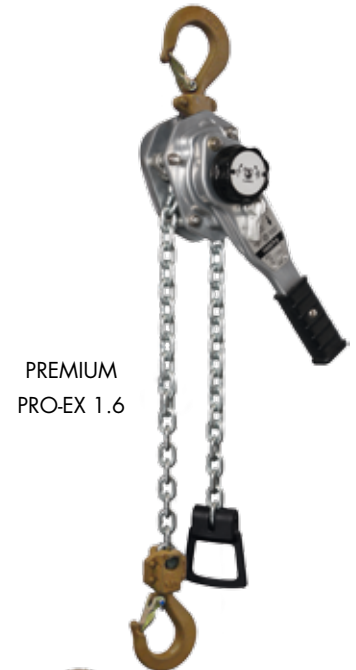
PREMIUM PRO-EX 1.6