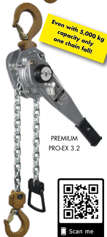
PREMIUM PRO-EX 3.2

Even with 5,000 kg capacity only one chain fall!